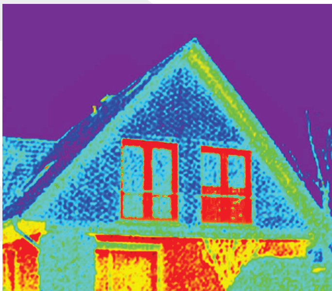
right-hand window: without honeycomb blind

Windows are the greatest source of heat loss in a house. Our energy consultant explains: "The older the windows, the more heat is lost. Cosiflor® Honeycomb Blinds can help to minimise heat and energy losses."